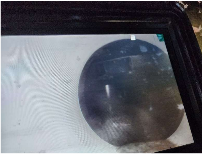
Picture of inside of pipe