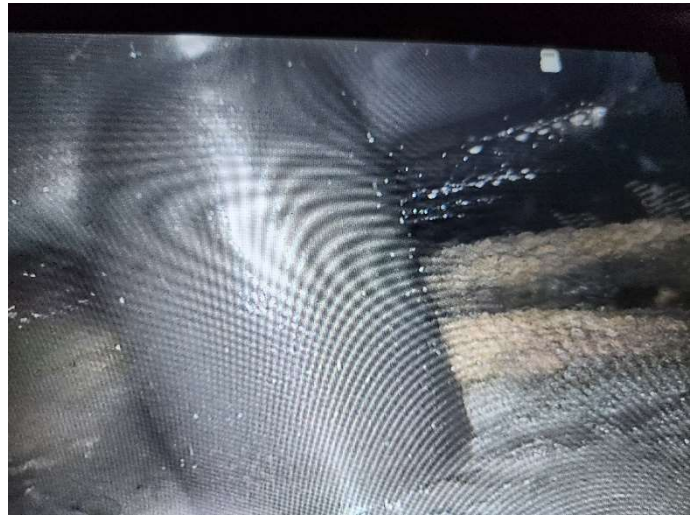
Picture of inside of chamber