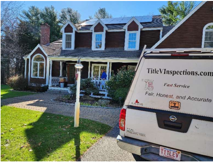
Picture upon arrival