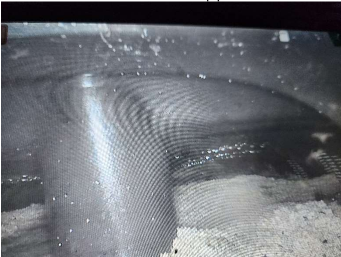
Picture of inside of chamber