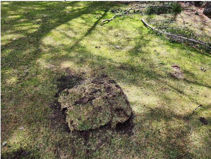
Picture of distribution box buried