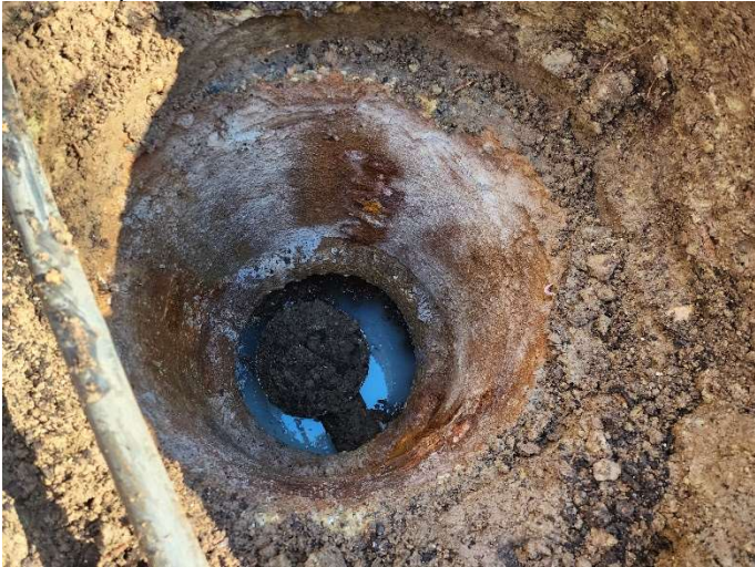
Picture of outlet after opening