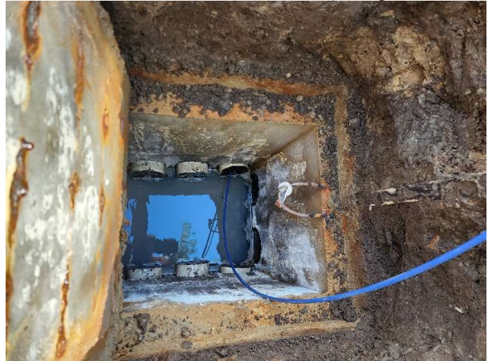
Picture of camera in first outlet pipe