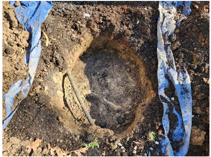
Picture of outlet cover before opening