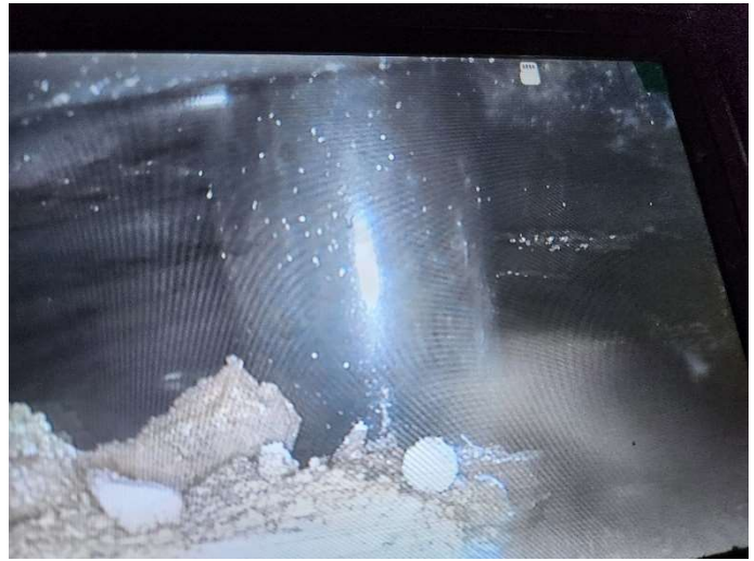
Picture of inside of chamber