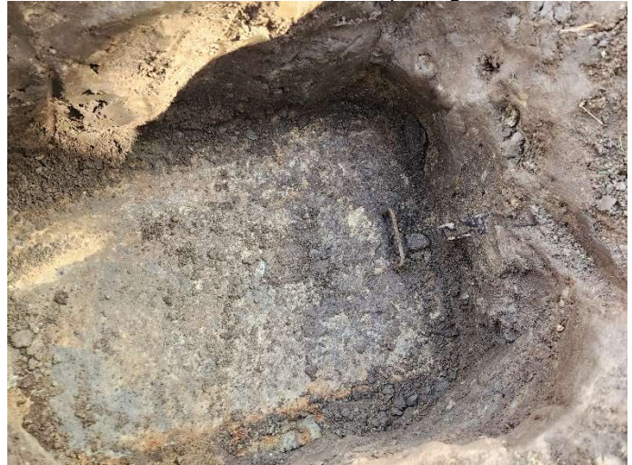
Picture of distribution box before opening