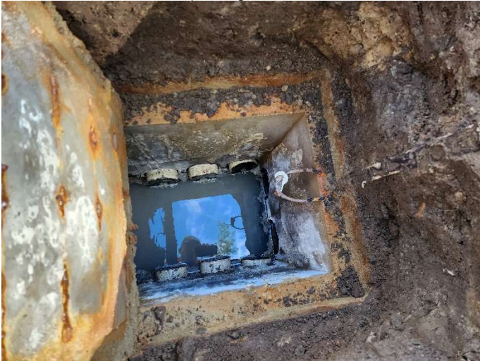
Picture of distribution box after opening