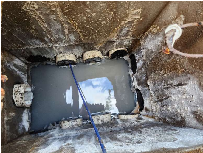
Picture of camera in second outlet pipe