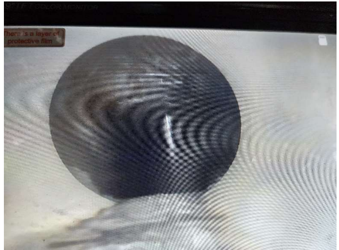
Picture of inside of pipe