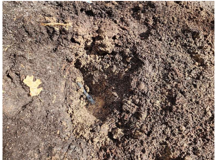
Picture of tank buried except irrigation line