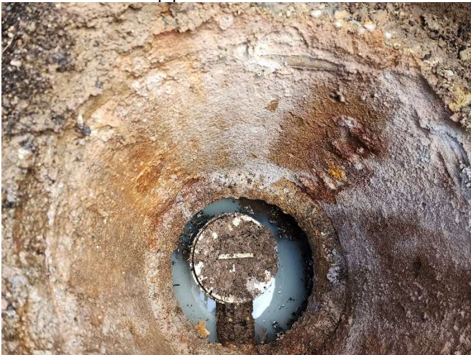
Picture of filter in place but not cleaned