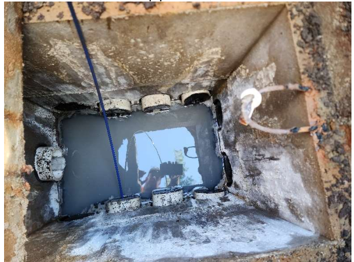
Picture of camera in third outlet pipe